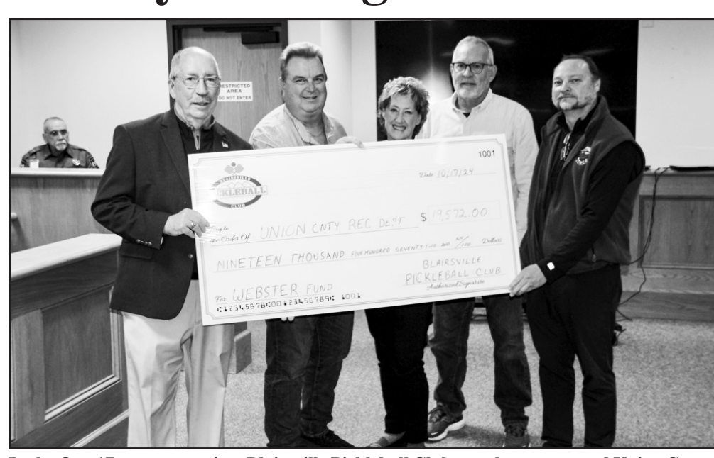
In the Oct. 17 county meeting, Blairsville Pickleball Club members presented Union County a check for nearly $20,000 they recently raised for youth sports participants.

contract amendment adds a new pre-engineered building at the Transfer Station, to cost $339,900.