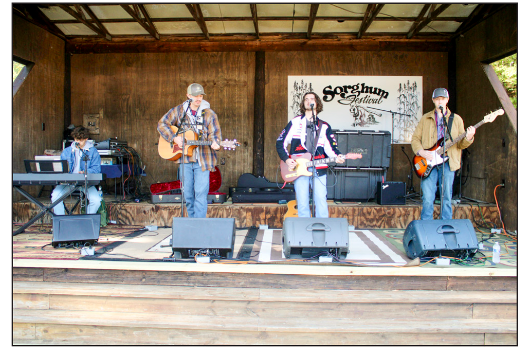
The talented local Riverbend Music band performed at the Sorghum Festival on Saturday.

The Blairsville Sorghum Local DAV Chapter Festival returns each year the second and third weekends in