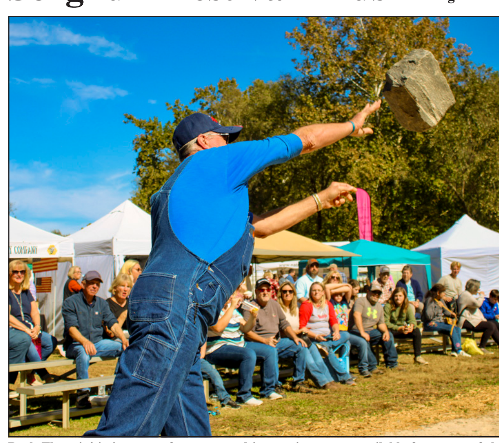
Rock Throwin' is just one of many crowd-interactive games available for guests of the Sorghum Festival each year. leaves and put it in piles for it