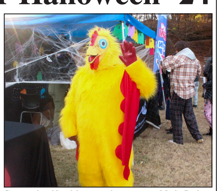
Communitywide trick-or-treating returns to Meeks Park on

organizations, businesses and even some individuals to hand out candy as a community. See Halloween Festivities, Page 3A